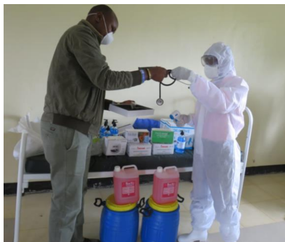
Supplies distributed at Emurutoto clinic.