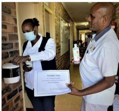
Staff members at Belfast Clinic in MPU.

Funds have been raised for 5 water borehole repair projects at clinics around Mpumalanga, which are now underway. The Hippo Roller campaign, launched in December last year raised funds for 75 rollers. A donation was received on 24 April for an additional 40 rollers. These are now under manufacture to be distributed to vulnerable households in MPU next month. The need to repair some community taps and boreholes has been identified and quotes are being sourced. We have allocated an estimated $7,000 to the budget in the interim.