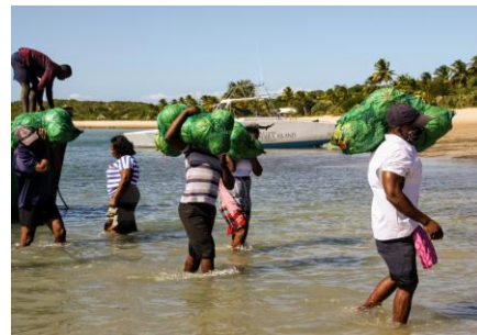
Images of the delivery and distribution of food relief on Benguerra Island