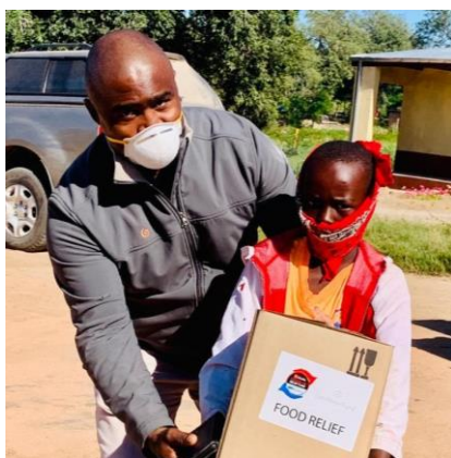
Lotus distributing food parcels in MPU

In KZN, Africa Foundation has partnered with Zuka Private Game Reserve in the fundraising and distribution of food support to households in KwaNgwenya community and is facilitating distribution in Mduku with the Sharks Rugby team, and Phinda, next week.